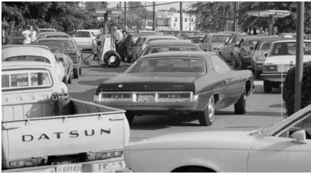
United States' support of Israel during the Arab-Israeli War led to an oil embargo. As a result, Americans experienced a gasoline shortage that led to rationing and an economic crisis relating to high prices, 1973.

Consider the history of the Middle East. One example was the creation of the State of Israel in 1948. How were diplomatic relationships carried out in the area? What role did the United States and Great Britain play? What were the long-term consequences for Israel? For diplomacy in the region? Or, students might be curious about the 1973 Arab-Israeli War and subsequent peace negotiations. What happened, and how did it impact the United States and other nations? What effect did these diplomatic relations have on the world economy?