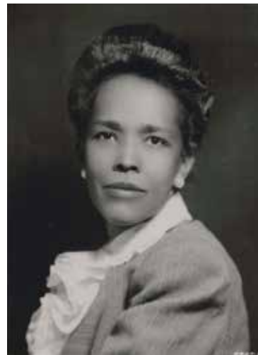
Ella Baker served as an activist from the 1930s to 1980s, working in several major organizations. Her papers are archived at the New York Public Library's Schomburg Center for Research in Black Culture.

Students interested in civil rights might investigate the role women played in the movement. Consider debates that occurred between African American women and their male counterparts. How did this affect and shape the movement? For instance, Ella Baker, a major proponent of the Civil Rights Movement, fought sexism in both the National Association for the Advancement of Colored People (NAACP) and the Southern Christian Leadership Conference (SCLC). 1 What were the results of these debates? Baker eventually left to help organize and advise the Student Nonviolent Coordinating Committee (SNCC). What influence did she have on the Civil Rights Movement?