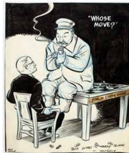
The 1948 political cartoon showed Josef Stalin seated on a table marked “Berlin Chess Game.” Stalin attempted to remove western influence in West Berlin, an area situated in communist East Germany. Truman’s and Stalin’s actions were depicted as a game of chess between two nations vying for dominance. ©Okefenokee Glee & Perloo, Inc. Used with permission.

Consider the many different topics surrounding the Cold War (1947–1991). The Cold War exposed many social and cultural issues in the Soviet Union and the United States. Students might explore the Berlin Blockade (1948-1949), the Cold War's first crisis. Soviet Premier Josef Stalin blocked U.S., French, and British railway, road, and water access into West Berlin, hoping the western powers would surrender the city. What was the initial impact of this action? How might the events have launched the U.S. and its allies into another war? How did this crisis affect the diplomatic relationship between western powers and the Soviet Union? Students might explore other Cold War topics such as the Truman Doctrine (1947), the Korean War (1950-1953), the Kitchen Debates (1959), or the Cuban Missile Crisis (1962). Who was involved? Were these events instances of successful diplomacy, or were they diplomatic failures? How did their success or failure affect the relationship between the Western and Eastern blocs during the Cold War?